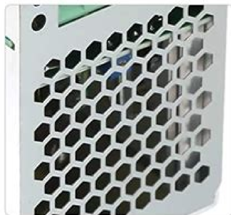
Thicken and hollow shell design makes better heat dissipation ability.