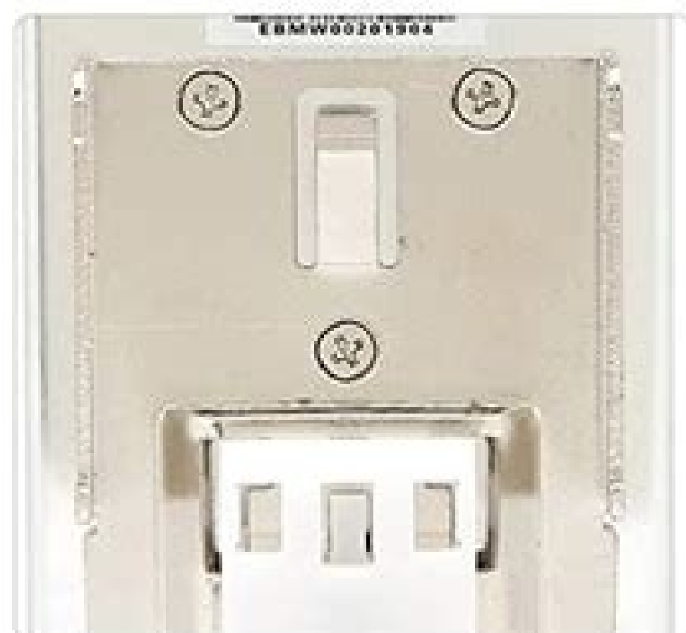
Guide rail installation in 35mm guide rail, more convenient.