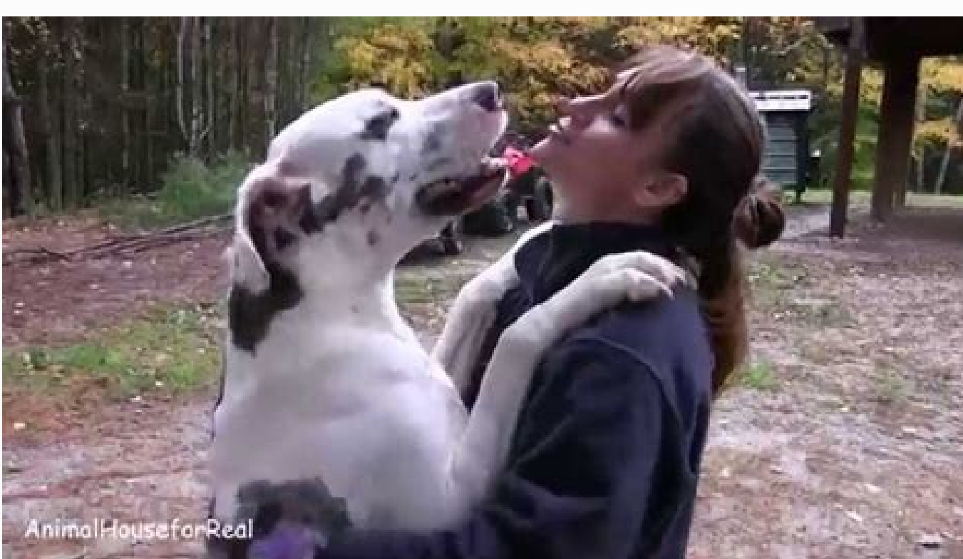
Great dane show dog requirements. What group is the great dane in at westminster. Great dane groups near me. What class is great dane in dog show.

Whether or not you accept it, go into the content using this site. Welcome to the official German Dog Club, Inc. Web site. We recommend that you take a look at this new site and enjoy the content you find. Whether you want to add a German dog to your life, or a long time a lingered mentor or dominate, this page has been designed to meet your