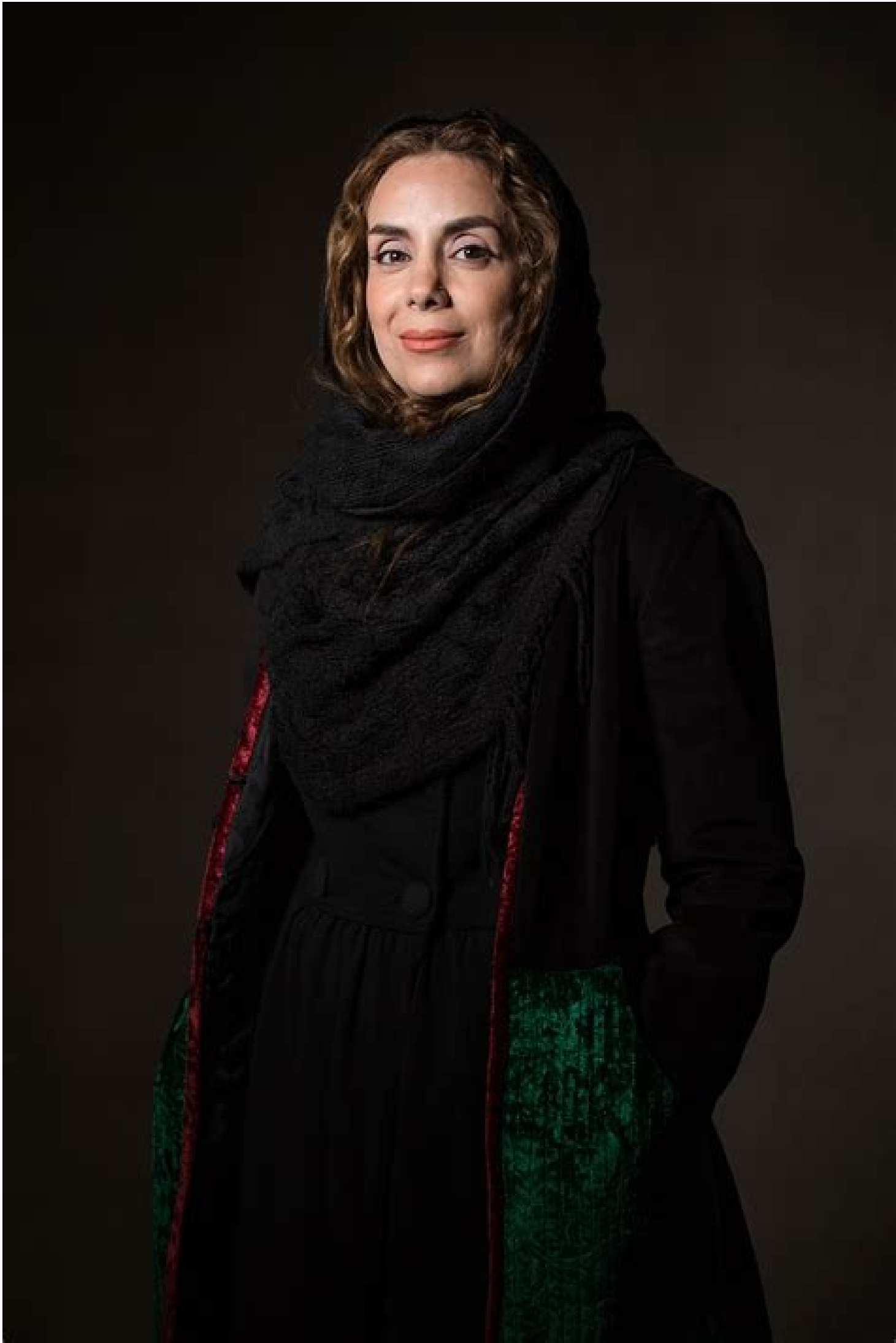
Iran performance artist