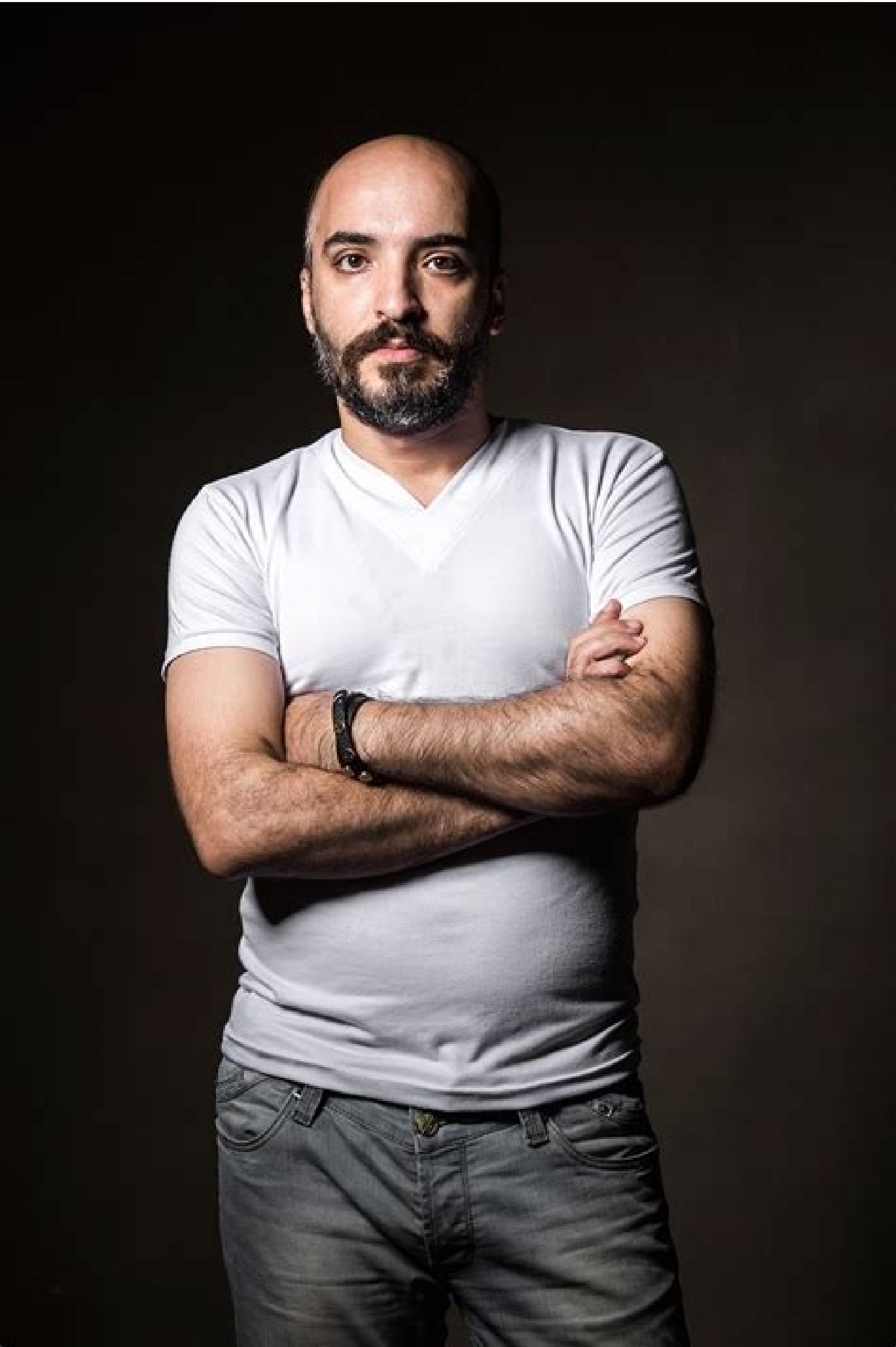
Iranian performance artist.