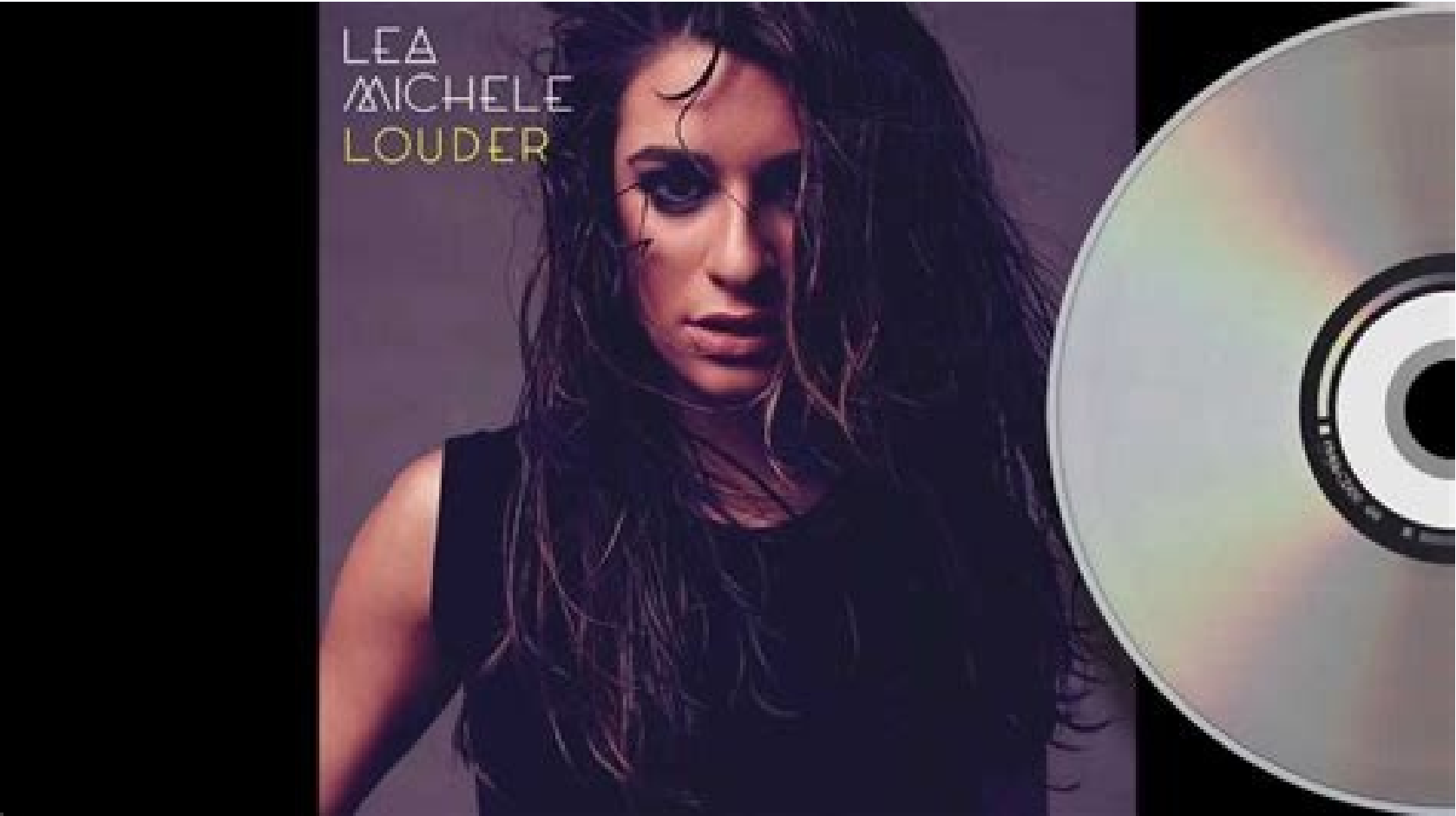
Lea michele cannonball lyrics. Lea michele cannonball. Lea michele cannonball live.